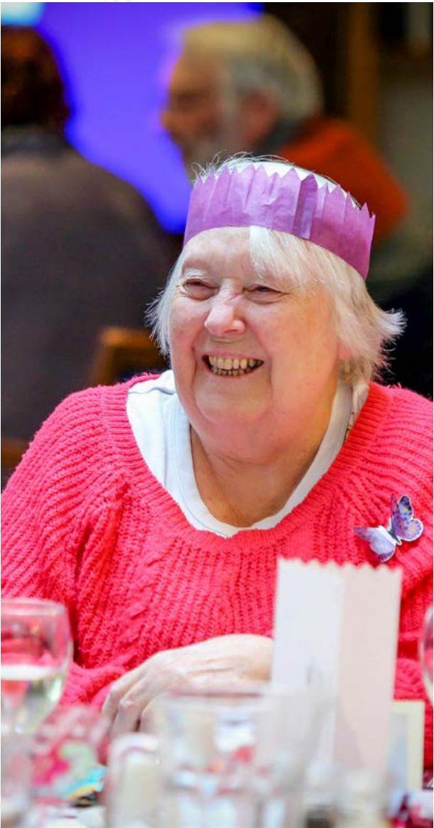
Vista's Christmas Party

More than 330,000 older people in the UK expected to spend Christmas Day alone. Research by Age UK (2019)