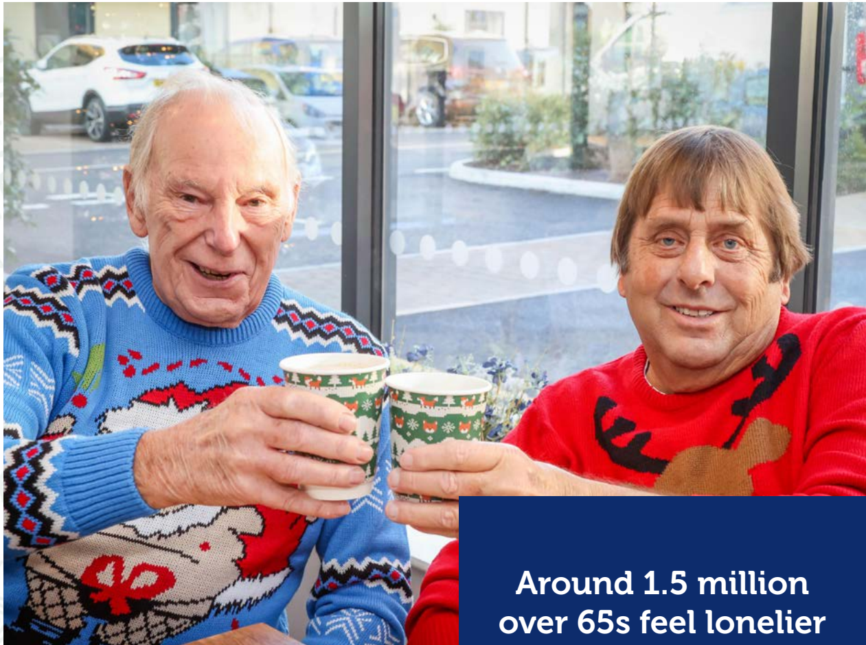
Homeowners at Chapters enjoy festive fun