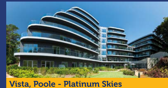
Vista, Poole - Platinum Skies