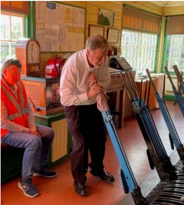
Vista Residents at Swanage Railway