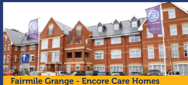
Fairmile Grange - Encore Care Homes