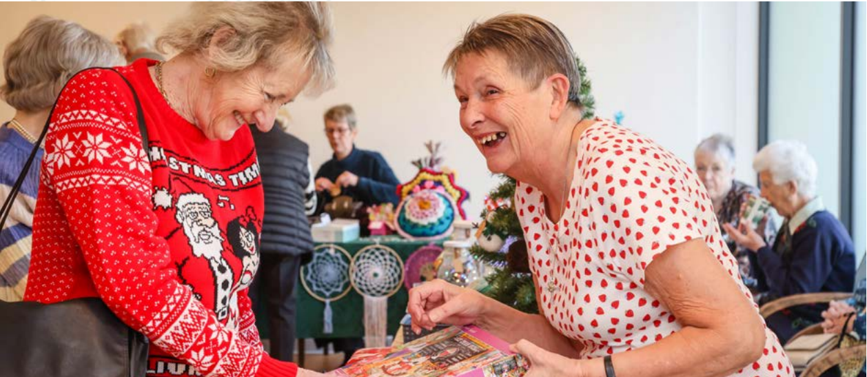
Chapters homeowners enjoy their craft market