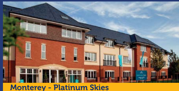
Monterey - Platinum Skies

needs of our growing elderly population. Partnerships founded on long-term aligned goals, such as ours with AHH, are good for our local community."