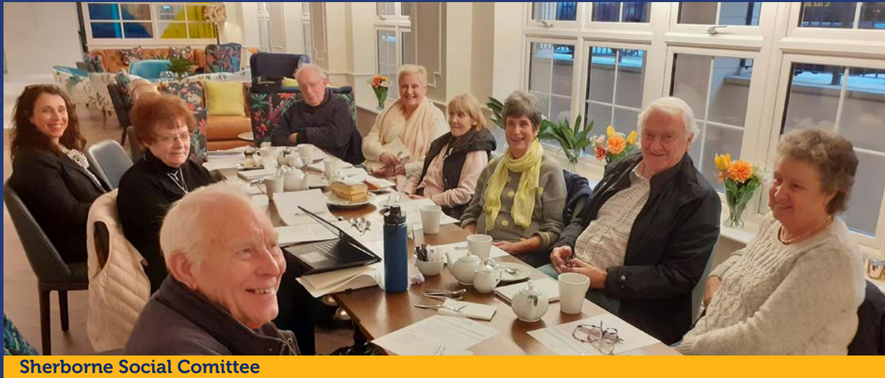
Sherborne Social Committee