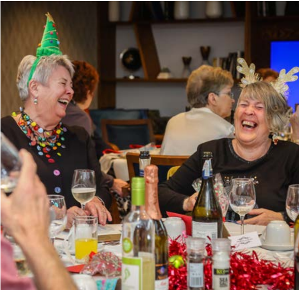
Homeowner at Vista's Christmas Party