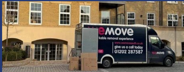
Move-in day at Mulberry House

It also offered the first chance for the homeowners to chat together to get to know each other and share stories about their different working backgrounds which include an architect and a doctor. Some homeowners who have lived in Sherborne for more than 45 years also shared knowledge of the local area.