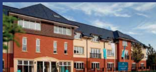
Monterey - Platinum Skies

needs of our growing elderly population. Partnerships founded on long-term aligned goals, such as ours with AHH, are good for our local community."