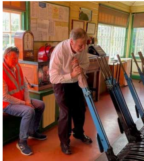
Vista Residents at Swanage Railway