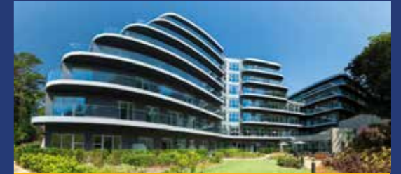
Vista, Poole - Platinum Skies