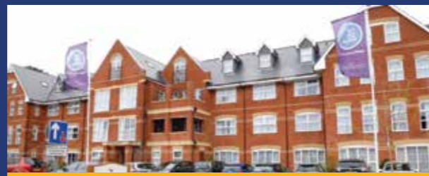
Fairmile Grange - Encore Care Homes